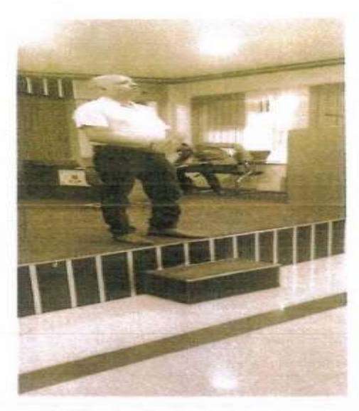
Session by the resource person